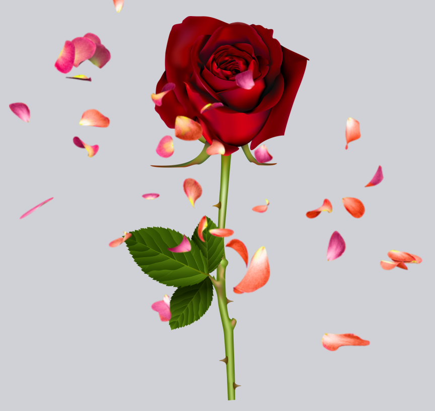
COSMIC AWAKENING INSTITUTE Red Eagle Universal Inc Publishing. All Rights Reserved

Remember, dear seeker, every upgrade is an opportunity to grow closer to your true self. Approach these changes with confidence and gratitude, knowing that you are worthy of living your most radiant life. The universe responds to the energy you put out, so embrace the joy of co-creating your dream reality.